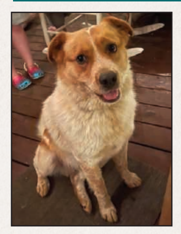
(Butter,)

A missing hero dog called Butter has saved a family from a fire before being reunited with his owners - and will be rewarded with a slap-up steak!