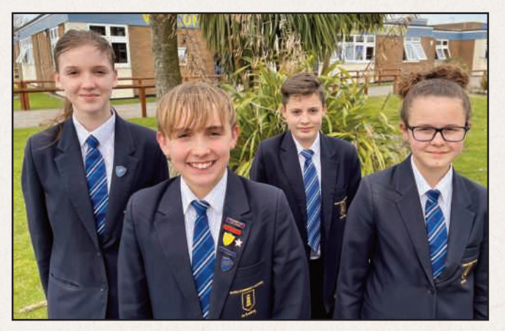
See goodnewspost.co.uk for full story.