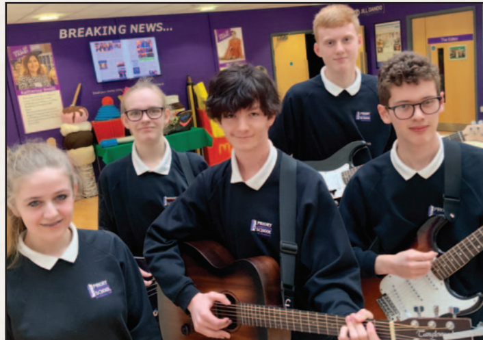
By Lacey Madge, 14

An incredible new Priory student band plans a charity and venue tour after belting out tunes similar to legendary pop band The Beatles.