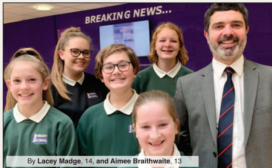
By Lacey Madge, 14, and Aimee Braithwaite, 13

Fantastic Priory students are blazing a trail in their GCSEs, sports, performing arts and amazing acts of kindness.